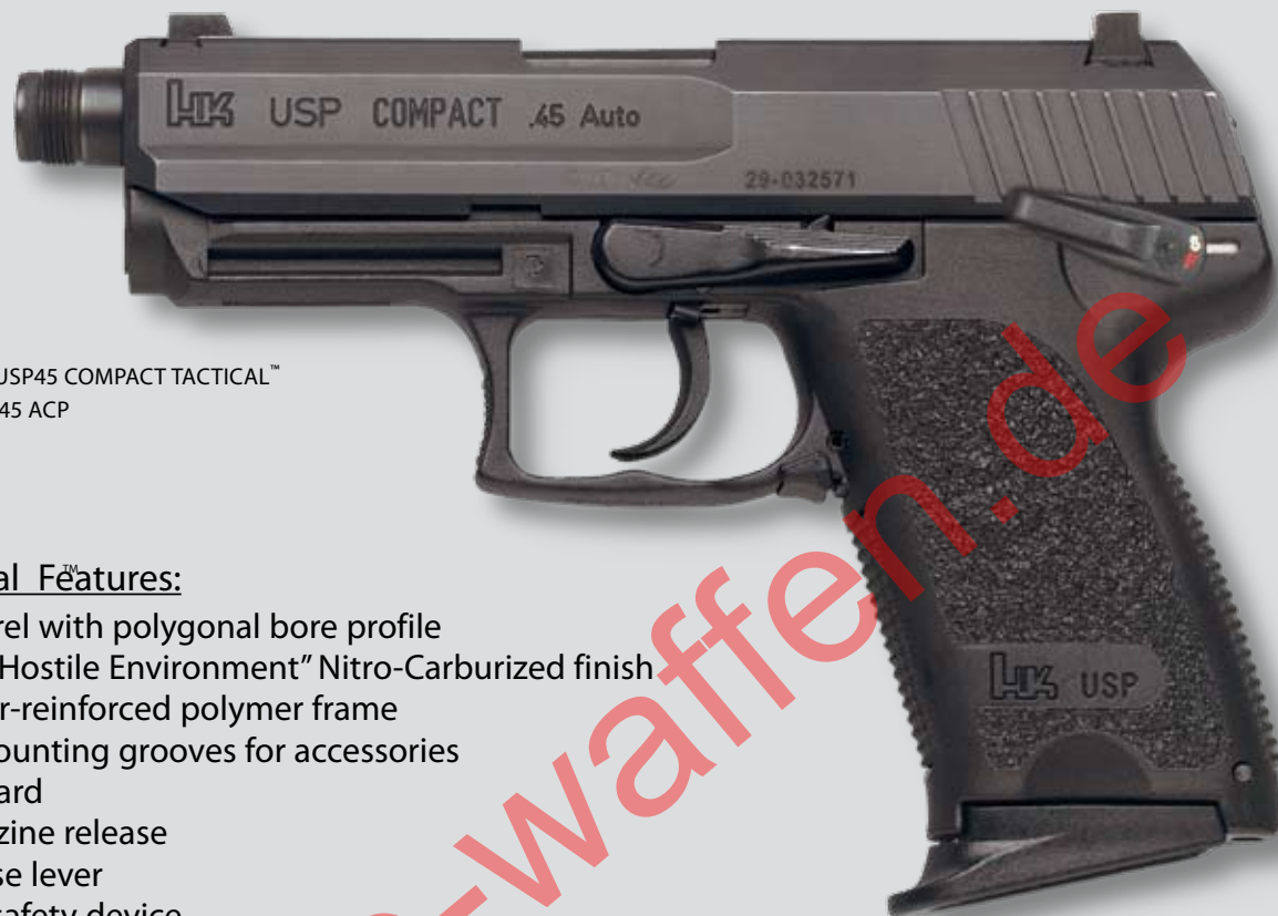
USP45 COMPACT TACTICAL™ .45 ACP