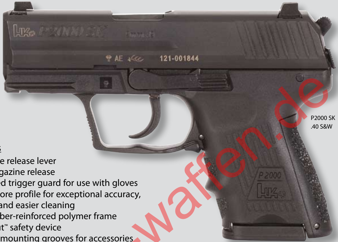
P2000 SK .40 S&W