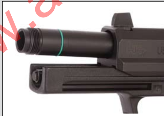
USP45 TACTICAL™ .45 ACP