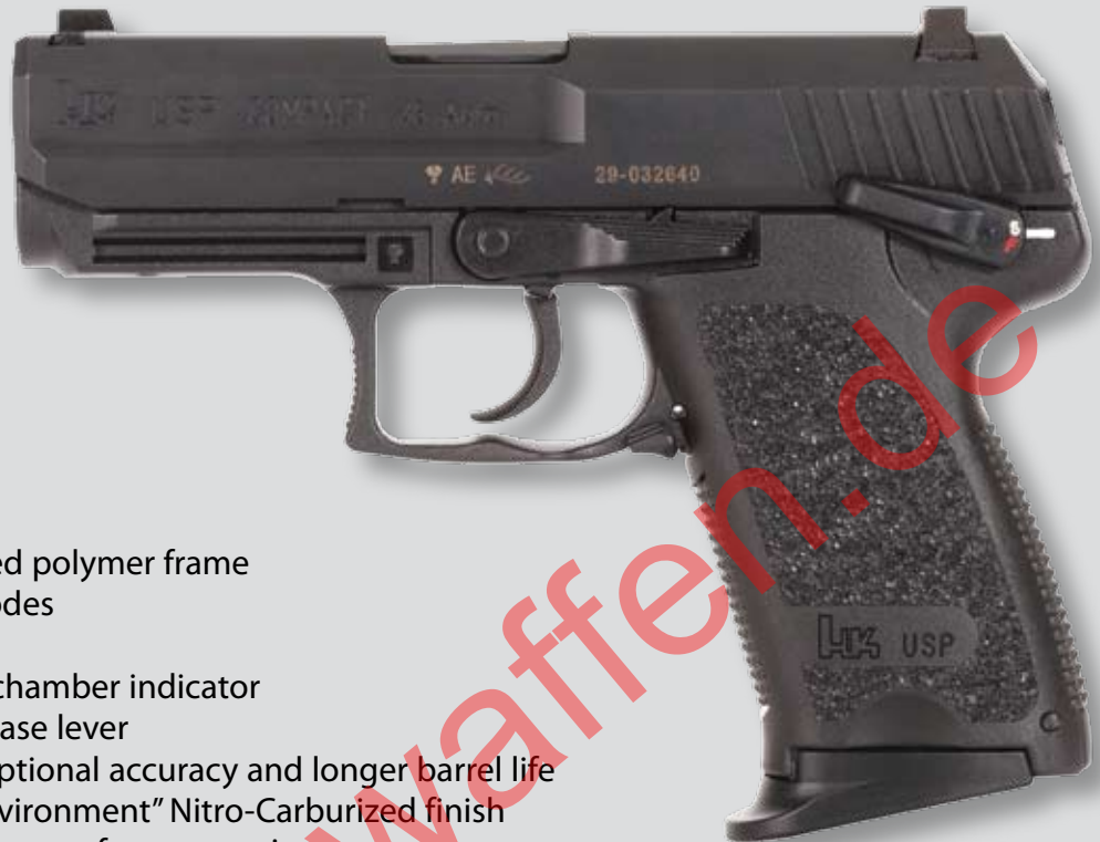
USP45 Compact™ .45 ACP